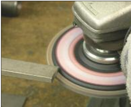
The Trimmable Disc's innovative design enables the operator to reduce the diameter of the backing to extend disc life.

Prices in this brochure are effective 5/1/12 and may be changed without notice.